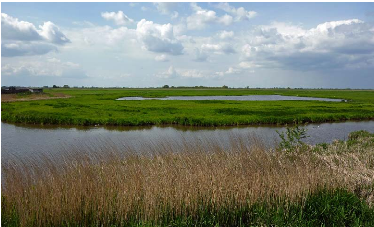
Welney and the Bluethroat Reeds

It has a ridiculously flash visitor centre. I think the entrance fee is what's paying for the centre as it is a shocking £6.70 each. But for a Bluethroat AND of the rarer white spot race we would pay a tenner each..... easy. Before we even got through the doors of the visitor centre we spotted several Corn Bunting in the car park and Wendy found two distant Yellow Wagtail in the nearby field. Both were bright males so nice ones to see for her first. In the visitor centre the bloke on the desk was again very friendly and extremely helpful with details on where the Bluethroat was so armed with his info and a reserve map we trotted off. We checked all the hides heading to the right but didn't see anything new for the trip. Eventually we reached the Bluethroat hide and there were a few bored looking people in there.... uh oh. We settled down for the long wait. While scanning the area a pair of Garganey appeared in the channel in front of us which enabled me to get a better shot than I had got earlier in the trip.