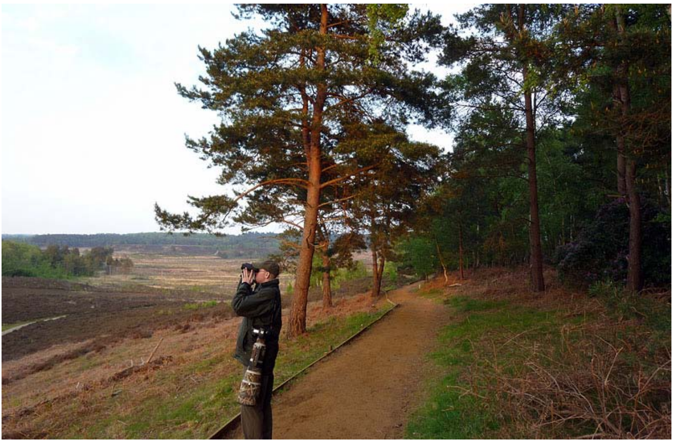
Looking out over Dersingham Bog