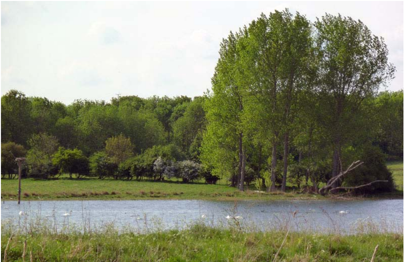
Osprey Viewpoint at Rutland Water

lucky we were both very tired by this point or he would have got both barrels. What a tool. We got to the Osprey viewpoint and we were very impressed to see that Anglian water have set up a 24 hour watch on the birds which is run, I think, by volunteers.