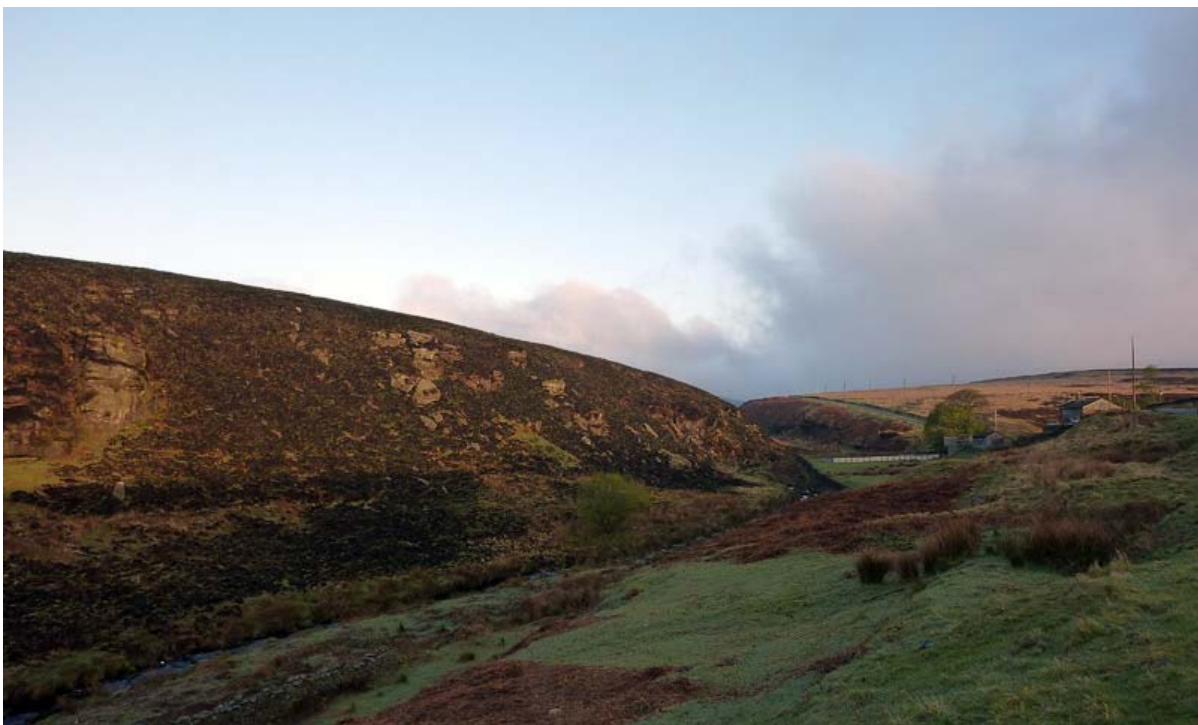
Widdop at 4am