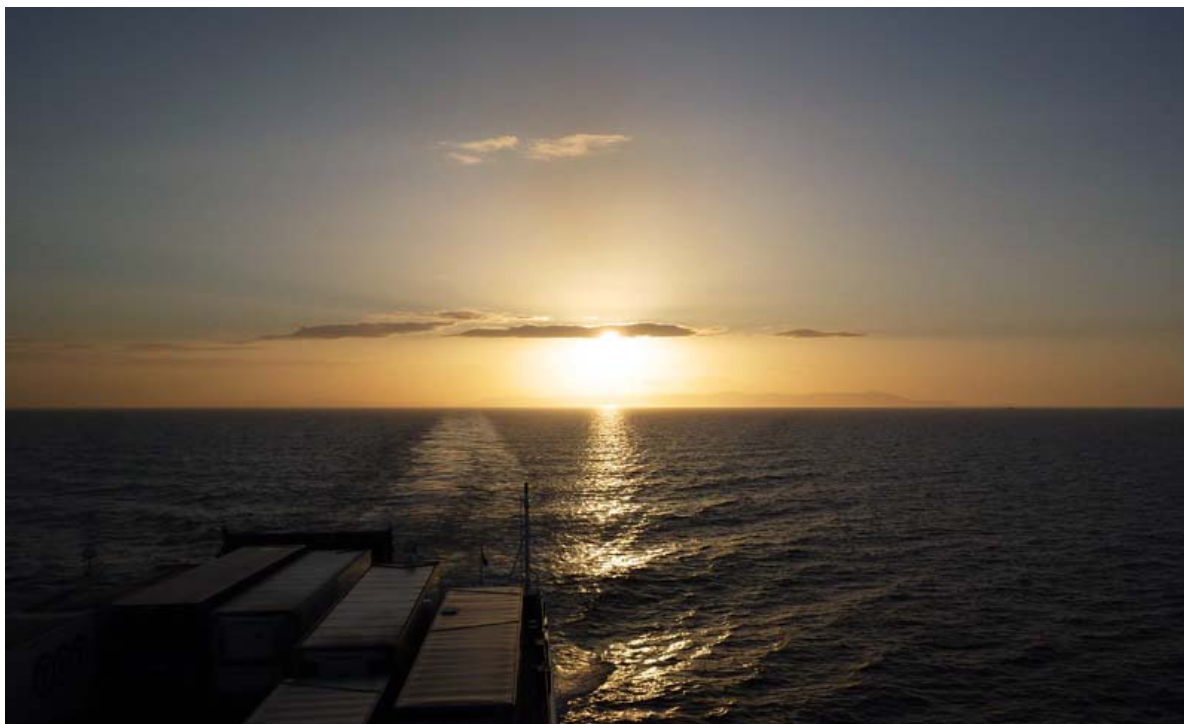
Sunset over the Isle of Man from the Ben.

The trip started on the Ben evening sailing. For the first 2 hours we seawatched from the deck hoping for a Petrel or Skua but it didn't produce anything of note just the standard seabirds. Guillemot, Razorbill, Gannet, Fulmar, Manx Shearwater, Shag, Kittiwake, Lesser + Great black backed Gull and Herring Gull.