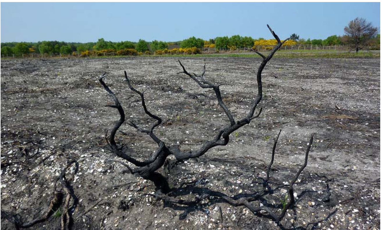
A burnt Kelling Heath

and a small unidentified lizard we saw nothing else so left at 2.50pm.