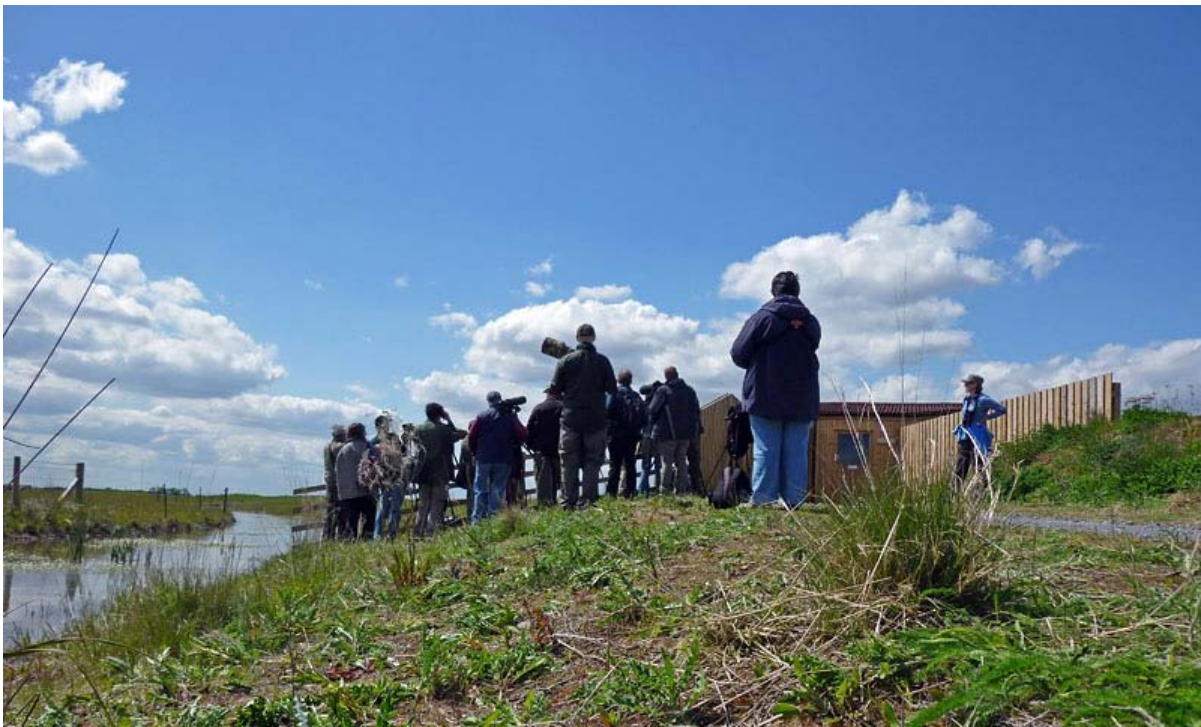
Monster twitch at Frampton Marsh

Approaching the East hide we realised it would be possible to get a closer view of the Pratincole..... only problem was so had about 30 other people, the crowd outside the hide was about 3 rows deep! Dohhh. We stood at the back but still got better views than earlier. I even managed to start attempting shots as it appeared in the gaps between people.