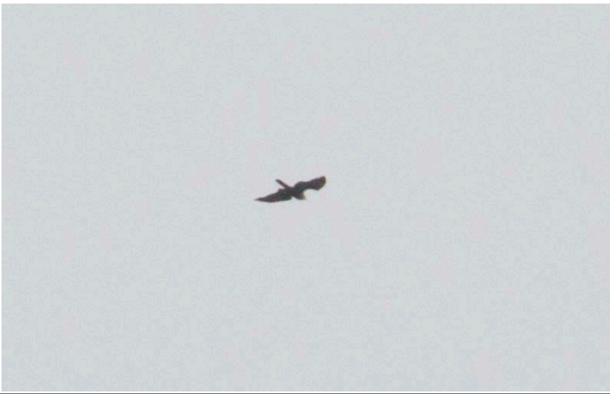
Unknown Raptor over Friary Hills