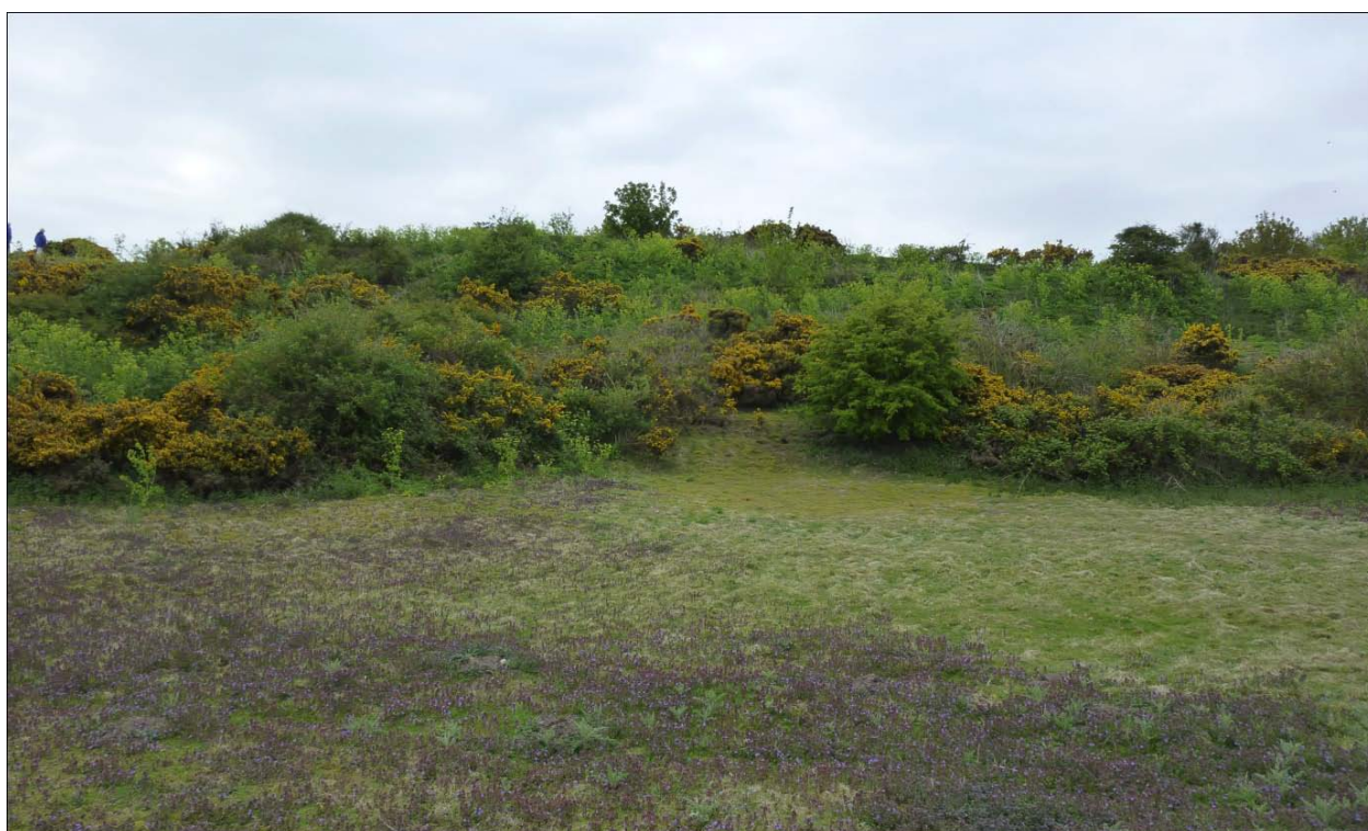
Looking back towards the Friary hills "hill"

The weather forecast had predicted that today would be the worst day of the week and they were bang on as when we arrived at our first location at 9.30am it was cold and threatening rain. If only the wind was easterly the rain would have pushed in some migrants but unfortunately the wind was northerly and flipping freezing! Our first stop was Friary hills which is a small area of high dunes right next to the salt marsh.