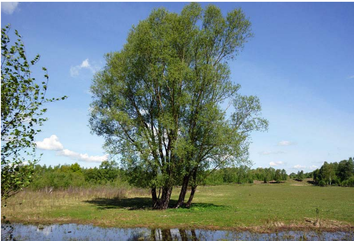
Green Woodpecker tree at Whisby NP

This was lifer number 4 for Wendy and we hadn't even reached Norfolk yet! On the way out of the reserve we had a look round the impressive visitor centre shop and Wendy got her coffee fix (even though she had already downed a flask of Coffee by 6am!) and we left at 11.10am.