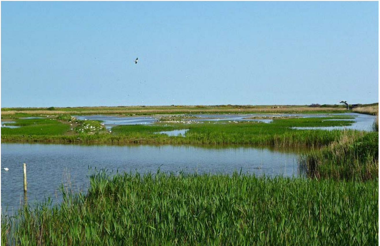
Freshwater scrape at Minsmere

We finally got to RSPB Minsmere at 12.23 pm. The place was absolutely packed to the rafters. A quick look at the reserve map and we realised why people recommend coming here, the place had about every type of habitat going, Woodland, Lowland heath, Freshwater scrape, Reed bed, you name it, it is here.