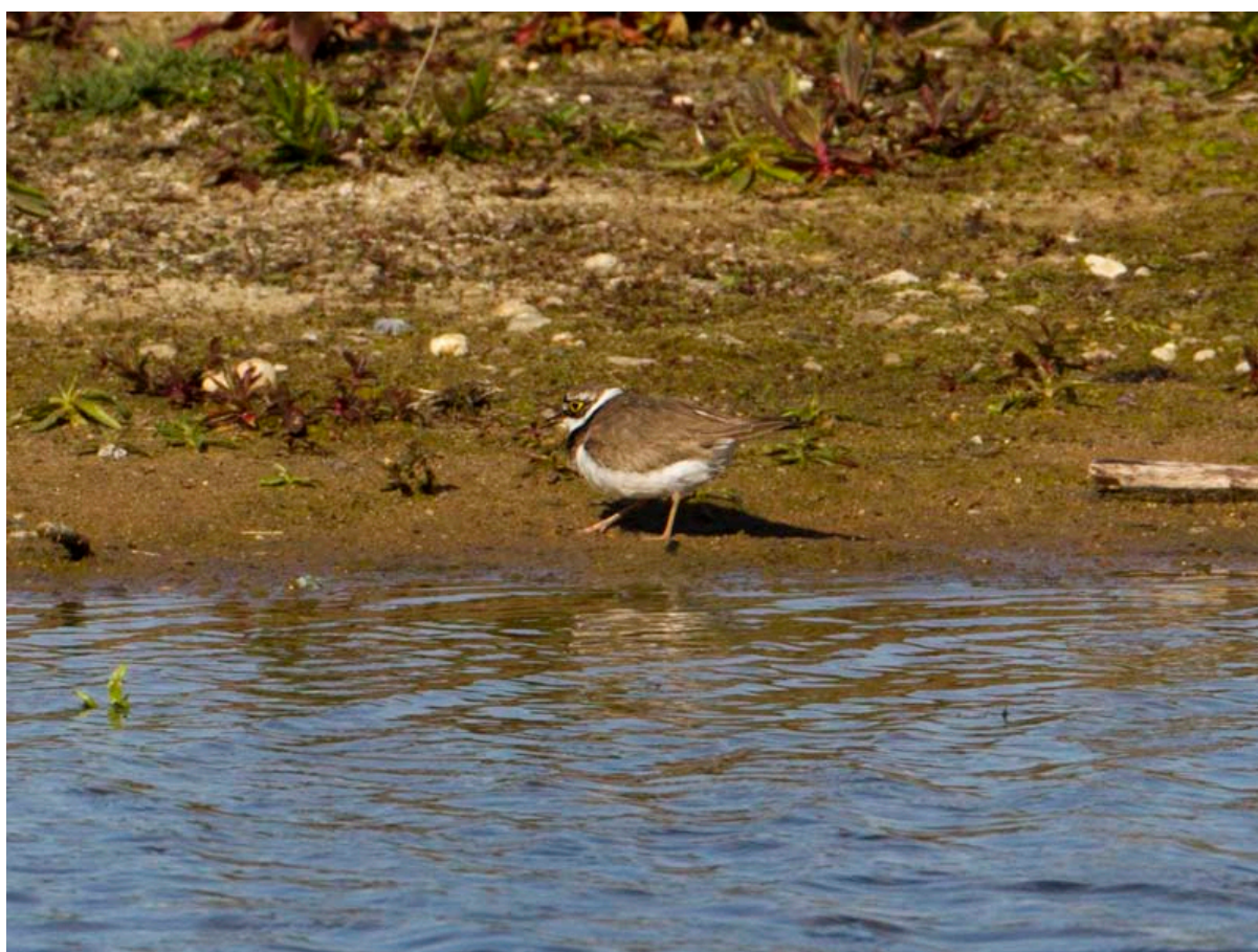
Little Ringed Plover

Reaching Whisby at 8.30am (after accidentally turning off the motorway too early and nearly driving into Doncaster :O!!!) we were lucky that the visitor centre was already open. It was very snazzy and the people seemed nice although we weren't given any reserve map. Nevertheless we wandered off with my own pre-printed plan to hand. Whisby is an ex gravel pit/industrial site and they have done an amazing job transforming the area. The Manx Government would do well to look at it to see how to transform our Gravel pits into a wildlife haven (if they can ever be bothered that is). The first lake had Common Tern and Black headed Gull breeding and a constant stream of Swallow, House Martin, Sand Martin and Swift feeding over it. On the muddy islands Wendy spotted a Little Ringed Plover bombing around. Lifer number 2 for Wendy and also my 2 nd ever view of one.