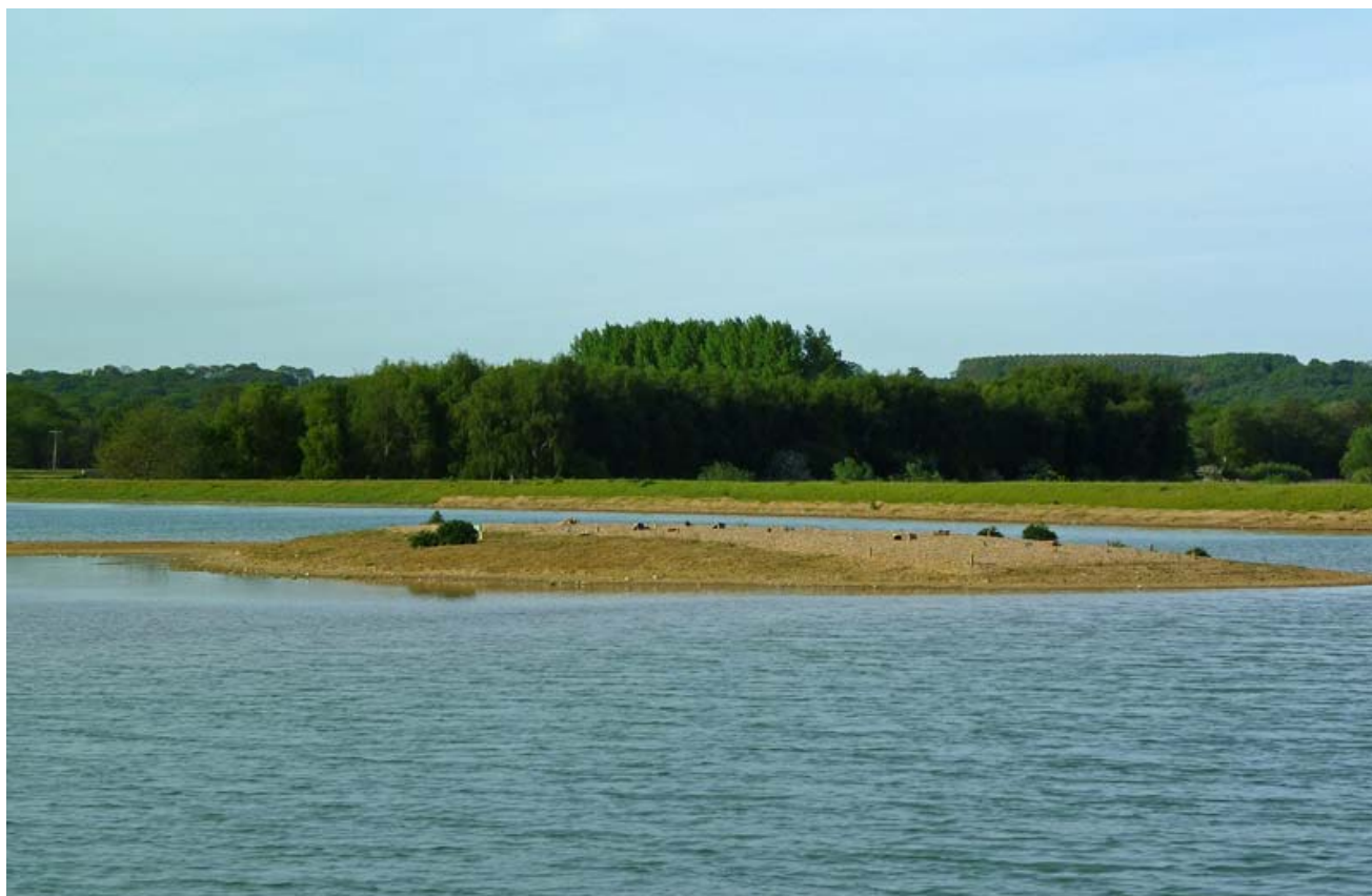
Rutland's wader scrape

We left there at 5.45pm and headed for the Egleton side of the reserve. We entered there at 5.59pm with 2 hours to explore it before the gates shut. As we walked off Wendy spotted another big raptor over the trees not too far away. It was another Osprey which must have been flying off to feed and we had a brilliant view of it flying past.....smart. There were hides everywhere here but we only had time to check out the northern section. Unfortunately we were seeing the same birds as in Norfolk so didn't add anything new until we got to the (very nice) Sandpiper and Dunlin hides which overlooked what looks like a shallow man made scrape. I wouldn't be surprised if Anglian Water had just made this section because they felt like making somewhere nice for birds. Take note Manx Government!