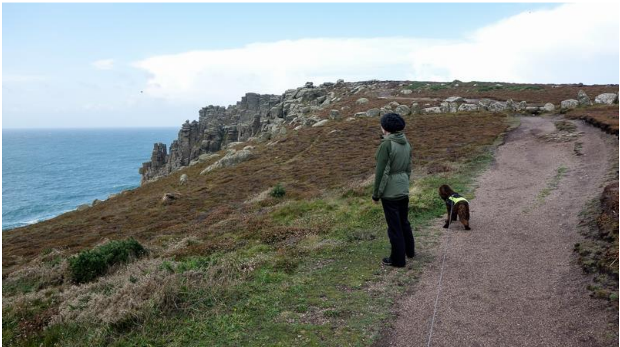
Taking in the view

After that we climbed up onto the heath that surrounds Land's End. As we climbed up the inevitable steep path a Merlin zoomed past chasing a Pipit and vanished into the cove below. We can only presume that it hit the jackpot, as we didn't see it come out again. When the path started to become more worn down we knew we were getting close to the end of the walk.