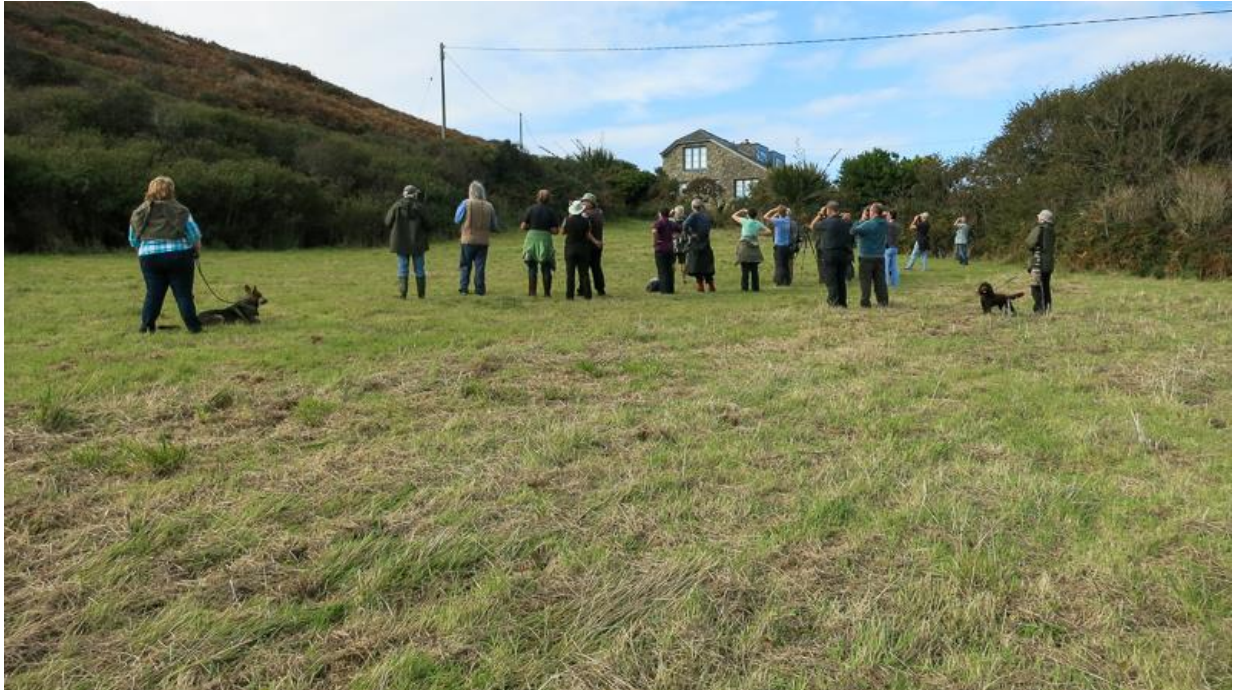
Subalpine Warbler twitch

Adrenaline was pumping through our veins as we parked up at Porthgwarra at 11.55am and there were loads of Birders standing around in the field next to the car park.