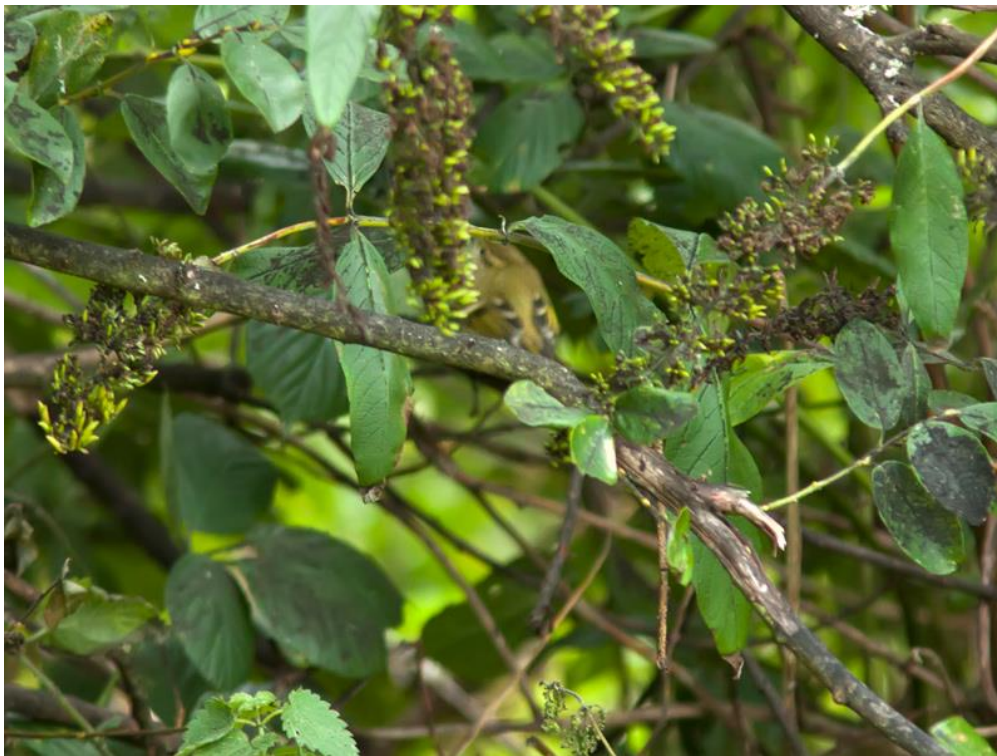
Yellow-browed Warbler – just about!

All of a sudden the sky turned grey and the Donkey's headed for the cover of the trees, so it looked like it was going to rain at any moment. As we were thinking of going another Birder, obviously a painter and decorator, turned up followed by another and both had come for the YBW! It wasn't a very good sign if the Cornwall Birders were making a special trip to twitch a YBW and made all our fears that nothing was happening in Cornwall a harsh reality....Uh Oh!