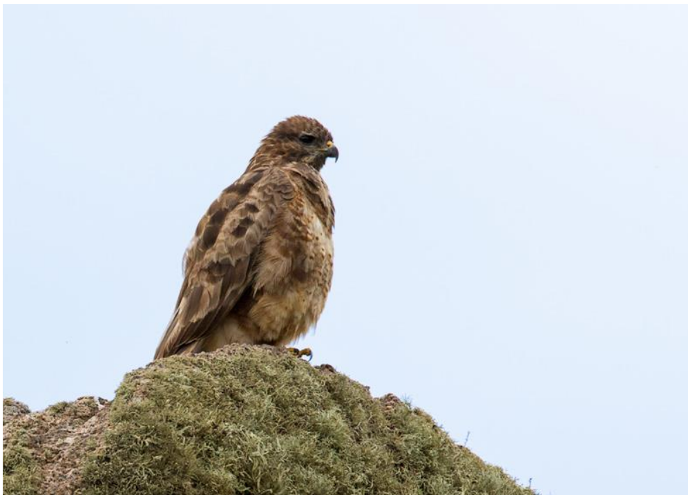
Gerroff moy laaaaand!

A grumpy looking Buzzard sat on a cliff top watching over us like it knew we weren't local.