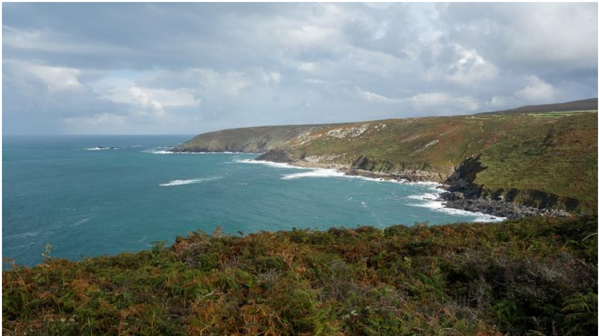
View from Zennor Head