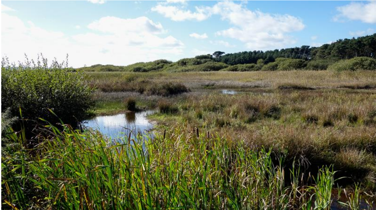
Spotted Crake pool

It was 2.44pm when we arrived at the charity car park by Marazion NR. There was an old bloke at the entrance taking the money so Wendy asked him if dogs were allowed and we were told, "Oh yes." Excellent, although we weren't hopeful of finding what we wanted but having just arrived we were still feeling optimistic. There was a Pied Wagtail in the entrance field and we headed straight over to the Spot Crake pool.