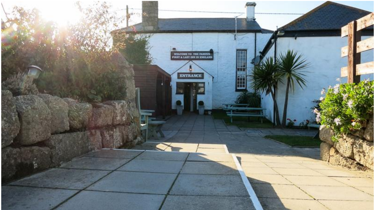
First and Last

As we passed the 'First and Last' we thought we'd try there, as we knew it was dog-friendly and had also heard that the food was good. I parked up at 4.45pm and we went inside hoping that they started serving at 5pm.