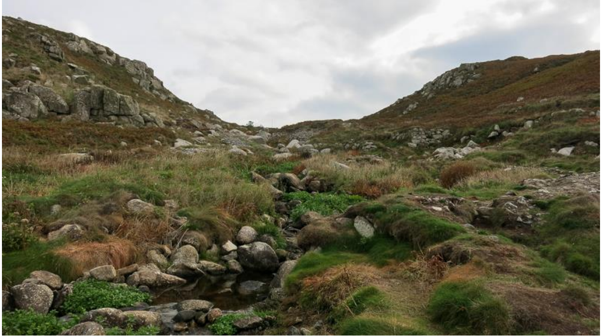
Bottom of Nanquidno valley

Shortly after the opening to Nanquidno Valley appeared, so we turned off and started the walk upwards.