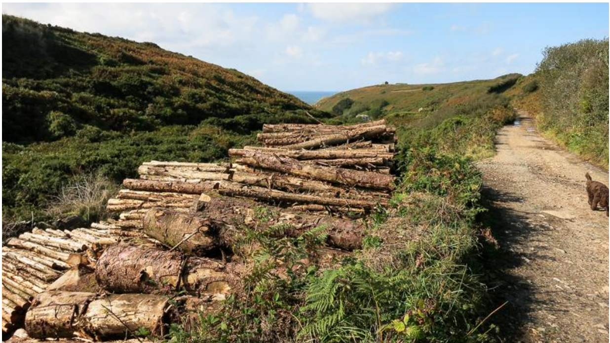
Wryneck log pile

Further down the road we passed a small field, which was home to 2x Donkeys who Lyca was very keen to go and meet.