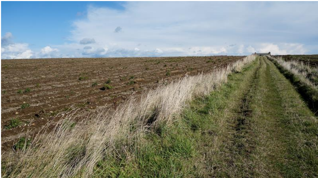
Spot the birdie!

The footpath turned off to the right, taking us behind the house and through some ploughed fields to St Levan. We'd been on that particular section of the walk before when we'd stayed at Porthcurno in 2012 and just as last time there were Meadow Pipits and Skylarks everywhere! We couldn't see them on the ground because they were so well camouflaged or in the troughs but we were nearly standing on them!