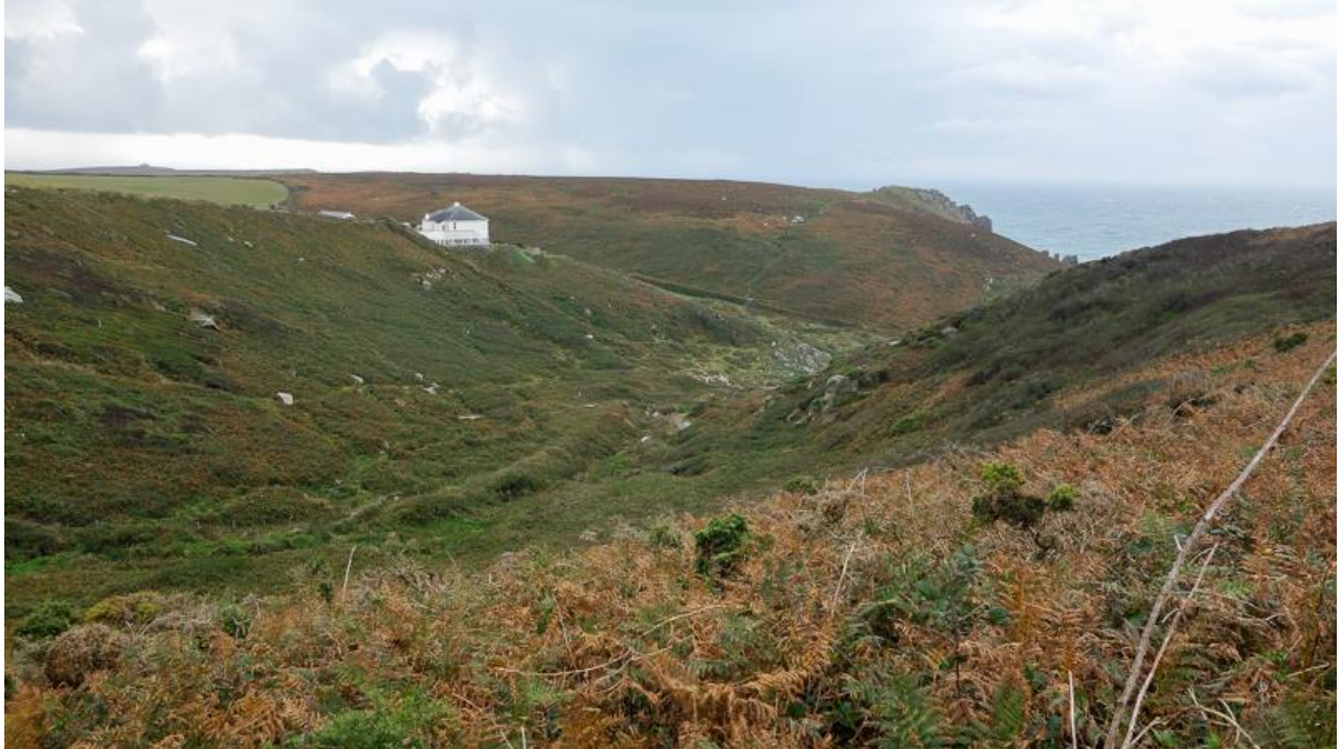
Going down into Nanjizal valley

The rain gradually eased, so we could carry on down the footpath to the bottom knowing fine well that we'd have to climb all the way back up on the other side. Why doesn't Cornwall have any flat footpaths? :/.