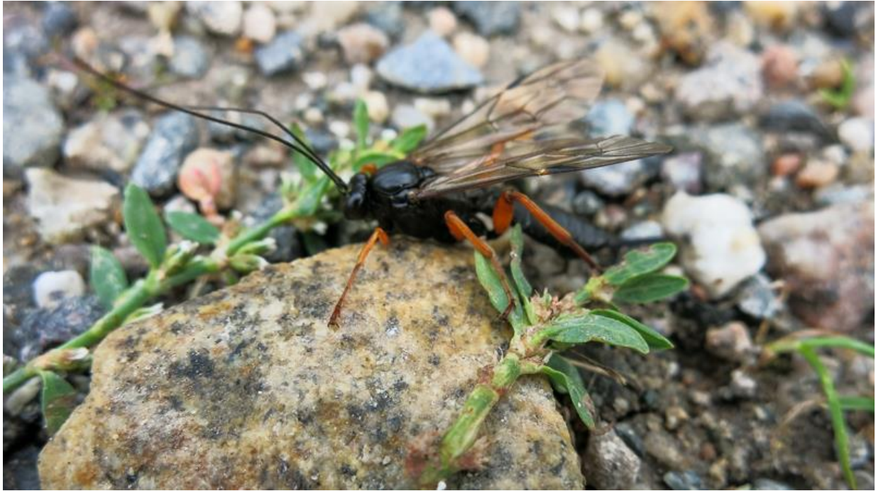
Black Slip Wasp

found a weird looking Wasp on the path, so she took a quick pic to ID it later and found out that it was a Black Slip Wasp.