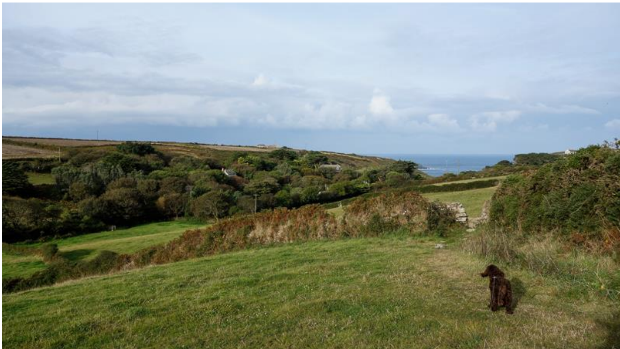
Heading down towards Cot Valley

Having made my mind up to keep the morning local we were ready to go out at 9.20am and all set off up the road to the footpath we'd been shown the night before. We saw a Dunno ck in the hedge as we walked down the steep field behind HQ and we noticed that we were heading towards a tree-lined stream at the bottom.