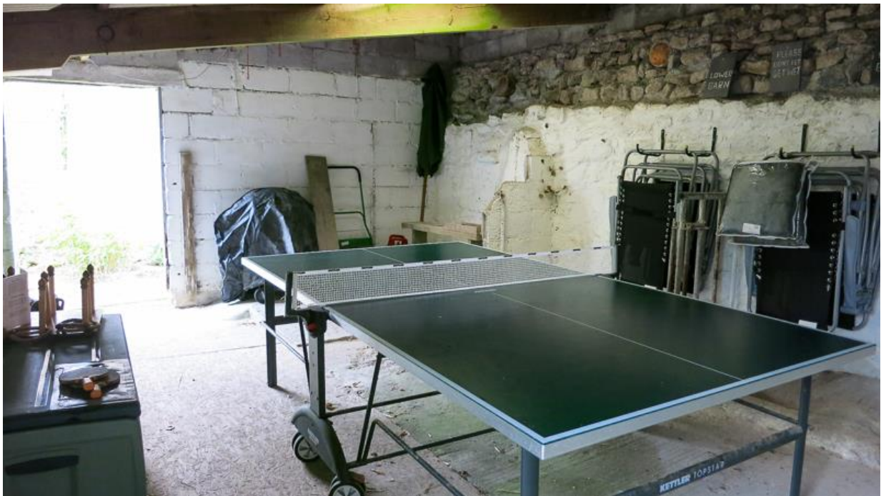
Table tennis – finally!

Surprisingly Wendy impressed me with a crazy wrist shot that would blast the ball but despite the power she lacked control. With my weaker but more controlled shots I won 5-1....Skillz :P. We just wished we'd able to do it a few more times before we'd left, as it was great fun. Not only that but I'd brought my bat and balls all that way for nothing! When we'd finished Wendy saw 2x Bats in the garden and heard the Tawny Owls calling from the trees running along the back of the garden. They were so close but it was way too dark to be able to see them. After watching some TV and getting the majority of the packing done (there was no way I was going to let Wendy leave it until the morning like on our last Norfolk trip) we were tired. It was our last night in Wesley's Barn but knowing we had a long day ahead of us we went off to bed at 10.56pm.