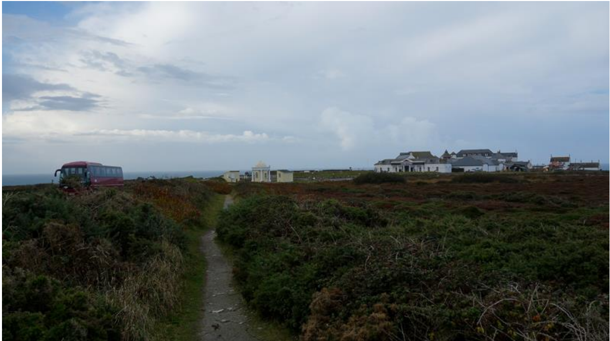
Land's End 'City'

I got a report of another Monarch Butterfly this time at Marazion beach but there was no mention of whether it was a fly over or what, so we assumed it was and didn't drop everything to bomb down to Penzance. It looked like the rain was never going to stop but after Wendy had been to the WC's and had a nosey round the shops it started to ease off. At 10.25am we had a window of clear skies so set off on our walk hoping that it'd stay dry.