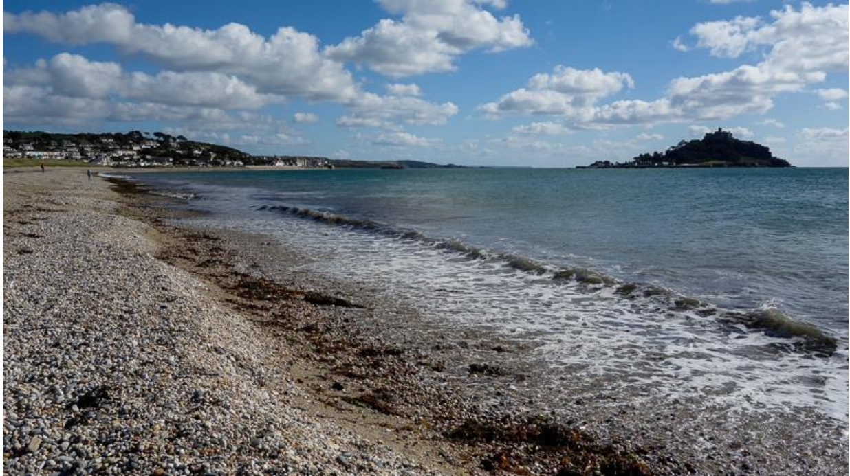
St Michaels Mount

sheltered from the strong wind, so was lying chilling out and soaking up the rays.....lightweight! The vista of St Michael's Mount out in the bay was stunning in the low Autumnal light and it was the perfect place to be on our 1 st day in Cornwall.