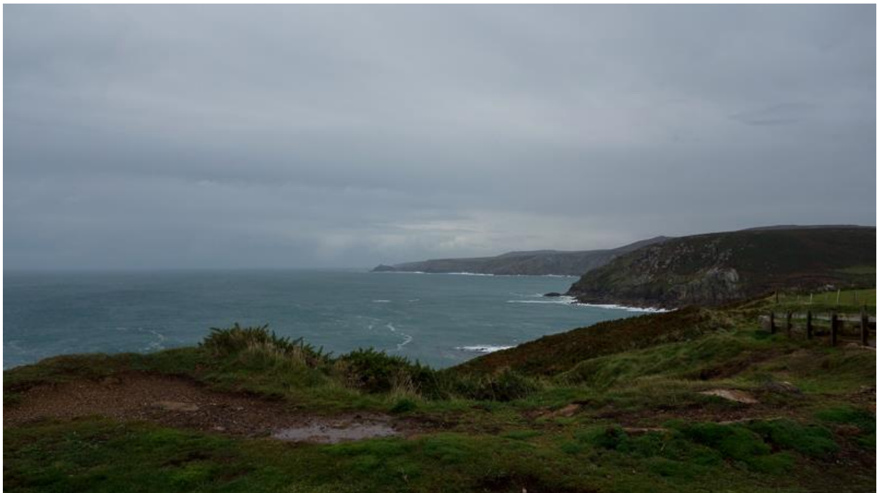
Grim view from Pendeen

We looked out and predictably saw loads more Gannets and Shags but nothing else. There was no point in us sticking around, so we headed back to HQ.