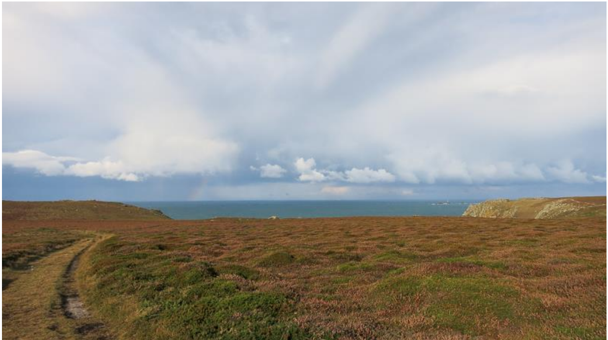
Squalls out to sea

It came as no surprise to us that there was nothing on the wall or even in the bushes on the way up a Bramble lined footpath. Wendy would stop every now and again to pick some Blackberries for Lyca, as she loves them and will even pick her own if she can reach! It looked again like we might be lucky with the weather, which was amazing considering the bad forecast. In reality we could see squalls in the distance but they looked like they would miss us and we kept our fingers crossed.