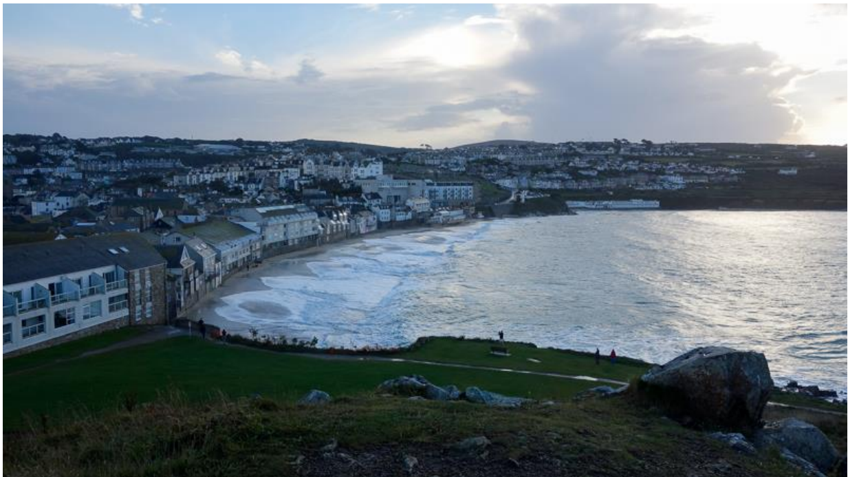
High tide line

There was no sign of the RCS even though I'd had a report of the bird from the car park at 3pm. We'd arrived 20mins after it'd been seen and yet again we'd done a great job of avoiding it....Doh. When I got back to the car Wendy had seen a Great Northern Diver out in the bay, which had been getting a bit of grief from a Black-back as it sheltered from the storm. Eventually it must've got sick of the hassle and flew further into the bay and out of sight. It wasn't the Little Gull or Common Scoter we'd hoped for but was still a new bird for trip, which we'd be lucky to pick up anywhere else. The car park ticket was due to expire so, after yet another dip, we decided to head for home at 5.51pm. As luck would have it, that was the time on my ticket, so we'd got our money's worth if nothing else.