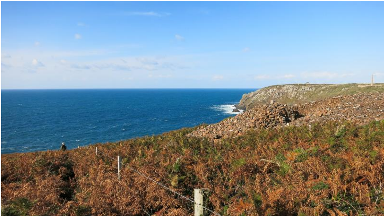
Looking for Wryneck

came over and spoke to us. He told us that the bird had been there for four days and that he'd seen it the day before. Why hadn't anyone put the news out? Grrrrrrrrrr! Apparently it was hanging around between the spoil heap and a mound further to the left, so we all spaced ourselves out, with our eyes peeled and bins poised at the ready.